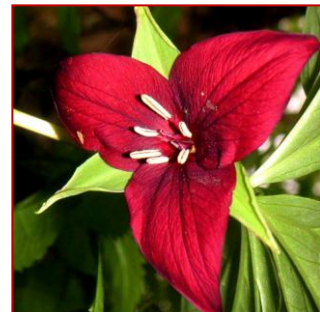
Gorgeous trillium in the Smokies