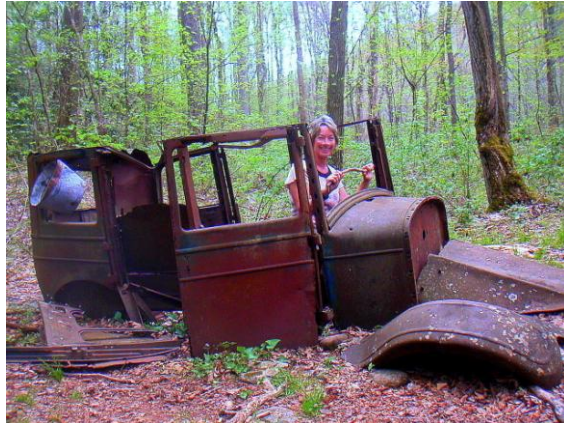
A relic of pre-park logging days in the Smokies